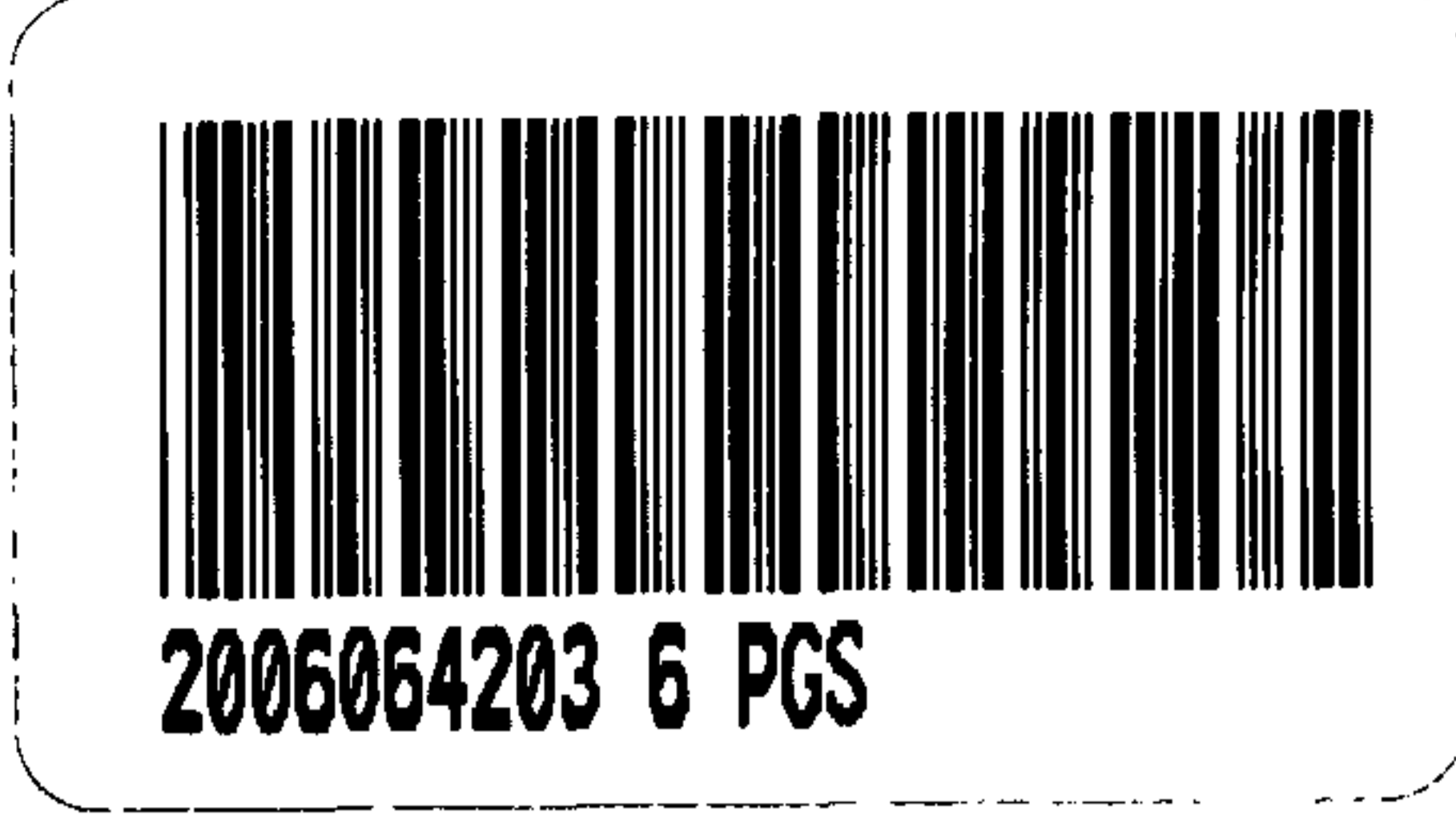
EXHIBIT "1" AFFIDAVIT

OFFICIAL RECORDS CITRUS COUNTY BETTY STRIFLER CLERK OF THE CIRCUIT COURT RECORDING FEE: $52.50 # 2006064203 BK: 2050 PG: 490 09/18/2006 09:01 AM 6 PGS AHOLMES, DC Receipt #038381